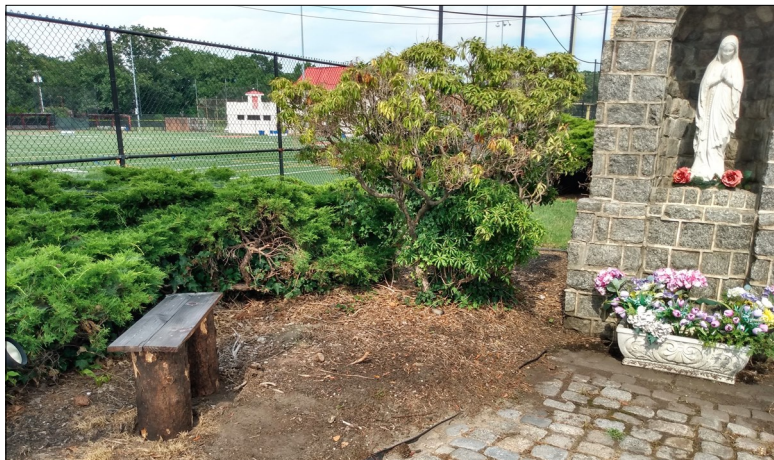
A place to sit and pray: A Santa Maria Brother built and installed a temporary reflection/prayer bench at our grotto while the Council works toward buying a permanent one.

Send information or photos to the Flagship at fronjian@aol.com .